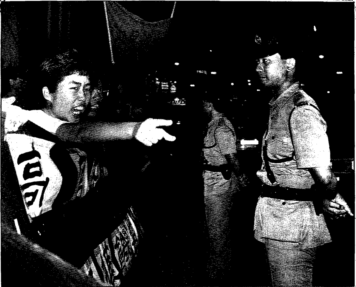
A strong police cordon keeps the protesters at bay outside the New China News Agency office in Wan Chai.